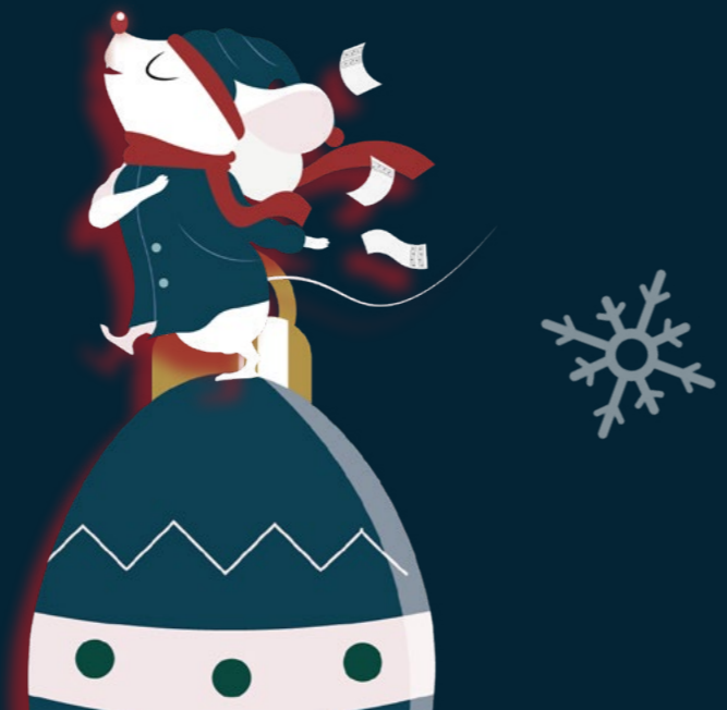
@ Sean Batty https://www.instagram.com/seanytheweatherman

Amey's winter service is comprised of 26 Frontline Routes, 15 Patrol Routes and 12 Footway Routes, a massive 1059km of network will require treatment this winter. The service will be delivered by 56 Econ gritters with snowploughs, 16 new footpath gritters, 12 tractors and over 100 Highways Operatives. Winter Patrol vehicles are equipped with the latest Mobile